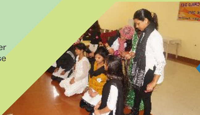
IMPARTING VOCATIONAL SKILLS

She is the child of a Sex Worker. Her mother keeps getting men into her house but doesn't want her daughter to know about this life. Hence, the child was put in our hostel.