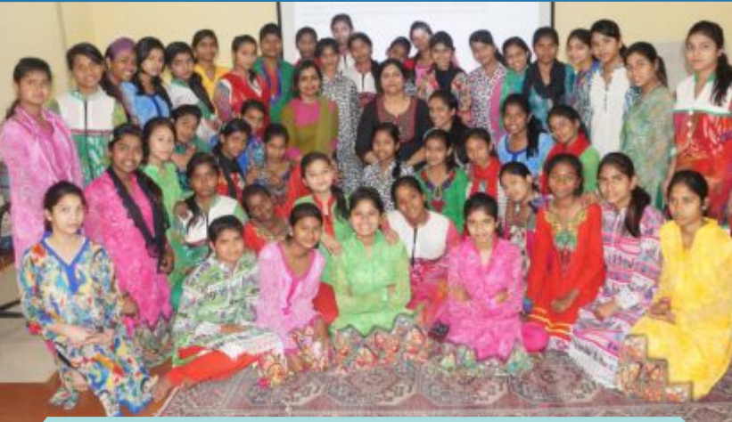
Awareness conference on Trafficking