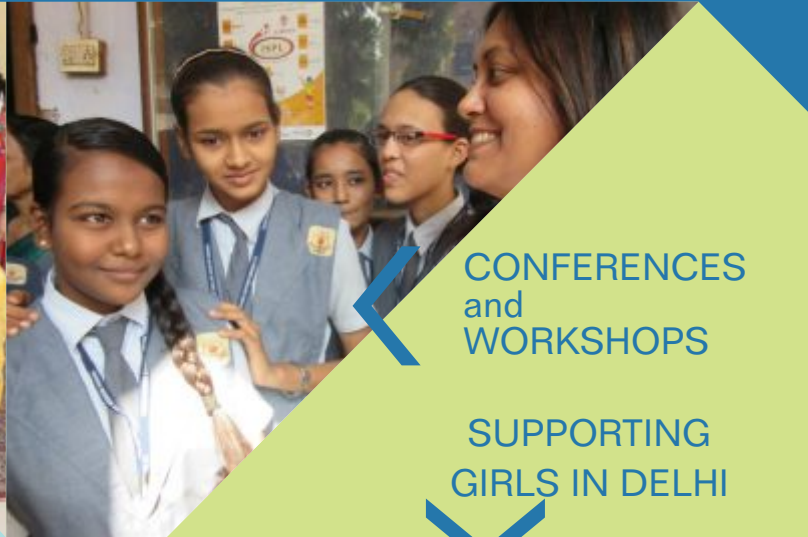
CONFERENCES and WORKSHOPS