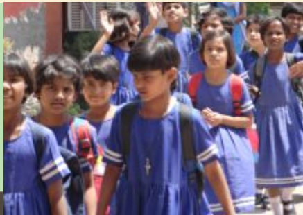
Disha foundation sponsors school and college education for economically weak children.

Now her mother also has AIDS; she is very weak, and may die any time.