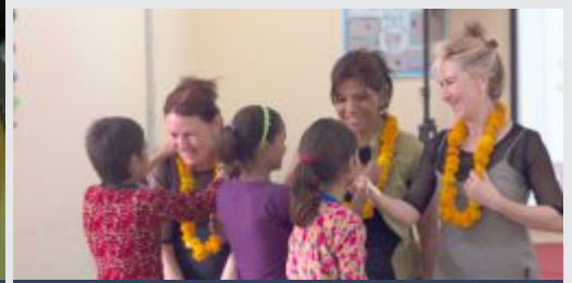
Volunteers from South Africa and Netherlands visit us