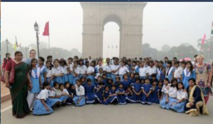
The volunteers of Disha foundation organised a tour through Delhi, seen here at India Gate