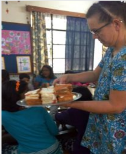
volunteers cooking and serving dutch meal for our girls