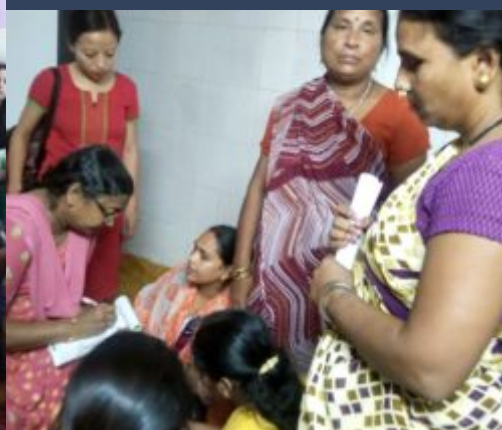
Our doctors prescribing medication and treatment