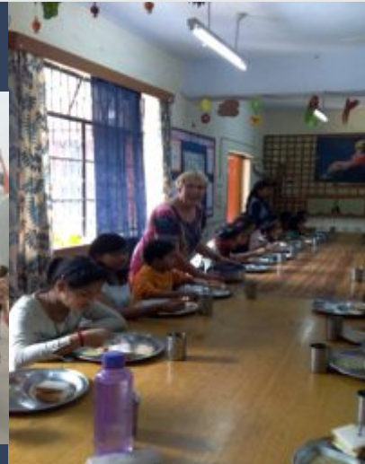
volunteers serving meal for our girls