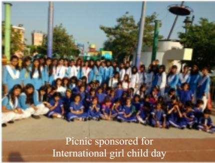
Picnic sponsored for International girl child day