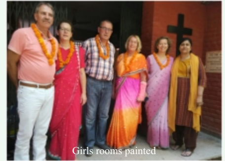
Girls rooms painted

Our volunteers came and painted the inside of the hostel as the girls told their colour choices. It was a real treat. The rooms are brighter and cleaner and the bathrooms repaired. We are very grateful to them.