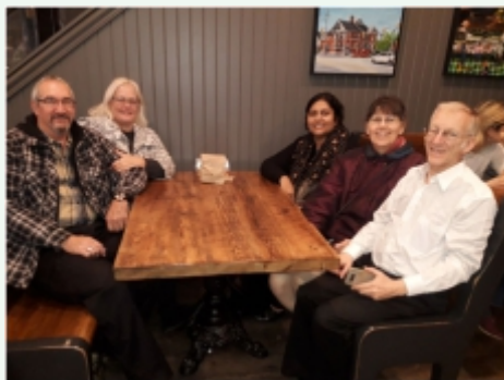
New Partners in Canada with their Steering committee members